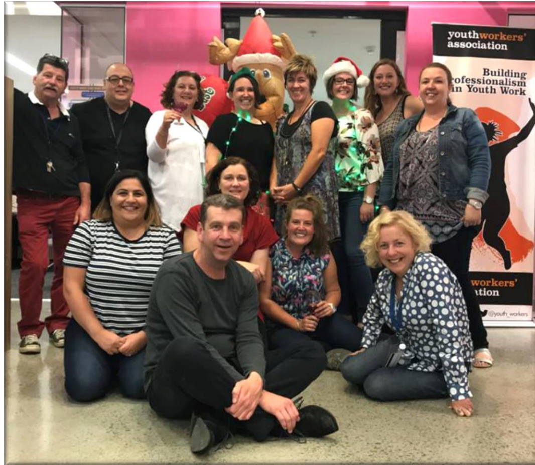
AALL Conference 2017 - Youth Work Writing Club