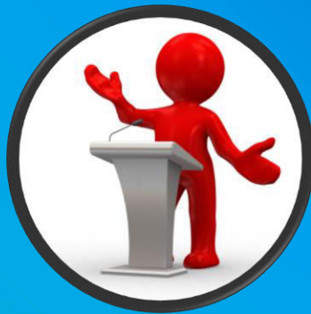
Introduction (5 min)