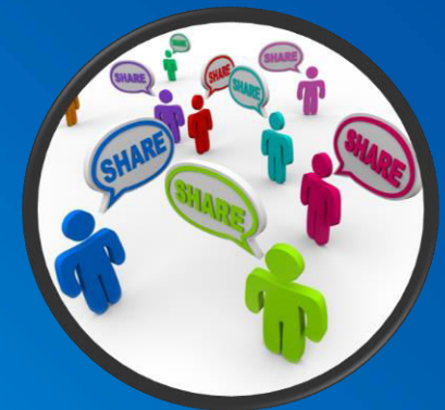
Share and connect (10 min)