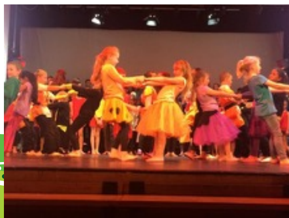
A few of the many highlights!

"Together we encourage, challenge and inspire while fostering a love of learning"