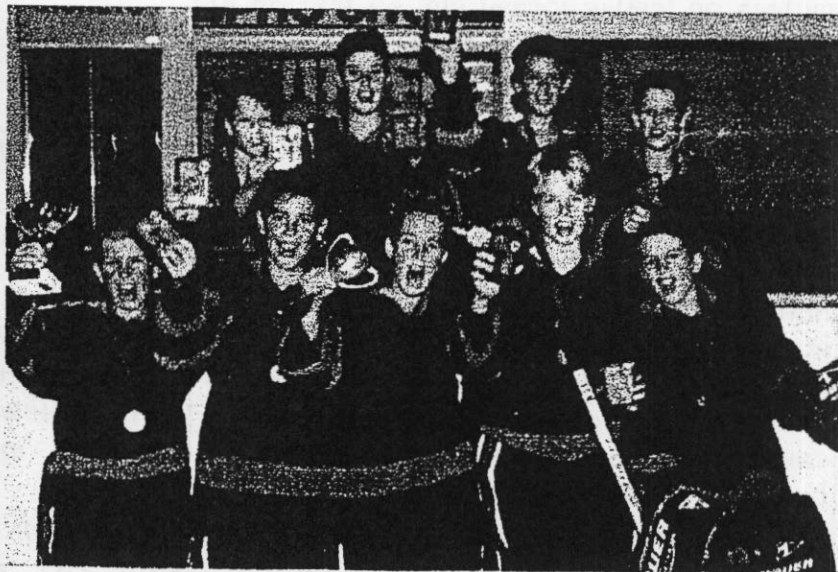
The Glenfield Blackhawks U12 team go on to take the Tauranga U12 trophy after their 1st place win at the Bauer Cup.