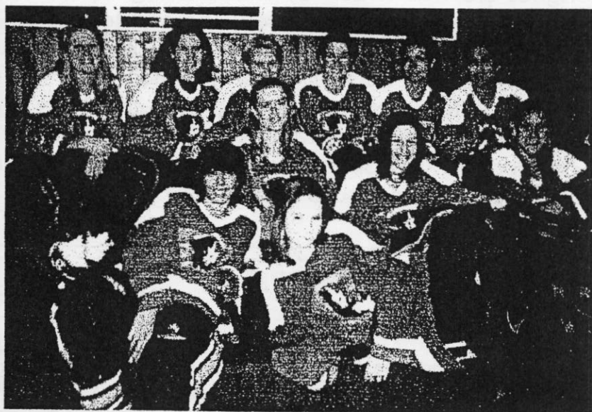
The Mt Wellington Panthers Women's team once again take the Trophy at the 1999 Bauer Cup for the second year in a row.