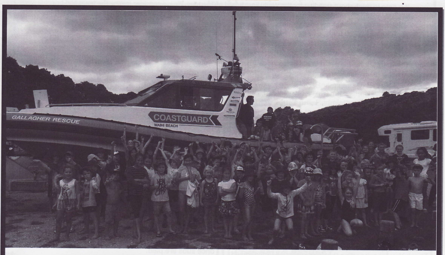
The Coastguard at Splash n Dash Day - Anzac Bay