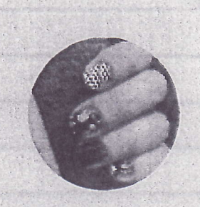
Nail Wraps $24 each or Buy3 Get1 FREE

Orders will be delivered to school and sent home