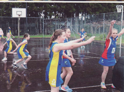
HipHop team. Rugby team. Yr 5 Netball team. Gymnasts. Yr 5 Soccer