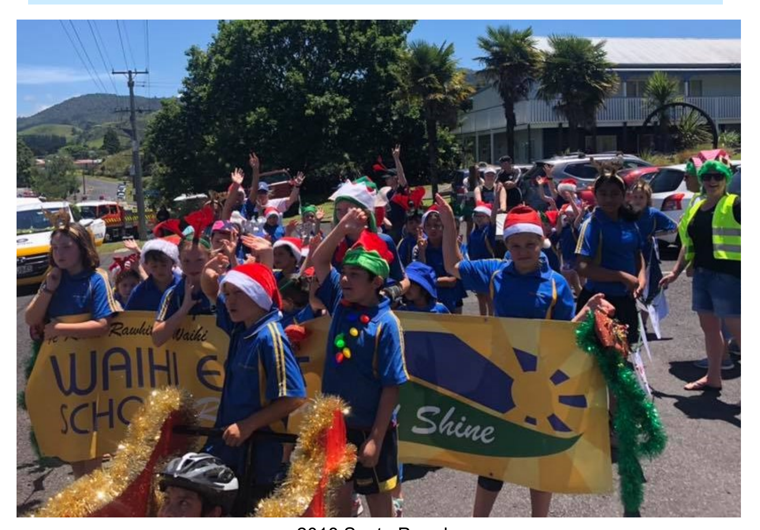
2018 Santa Parade

Waihi East Primary School Newsletter Term 4 2018 Week 9 12 December 2018