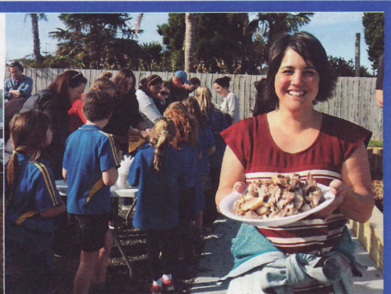
Term 2 Hangi