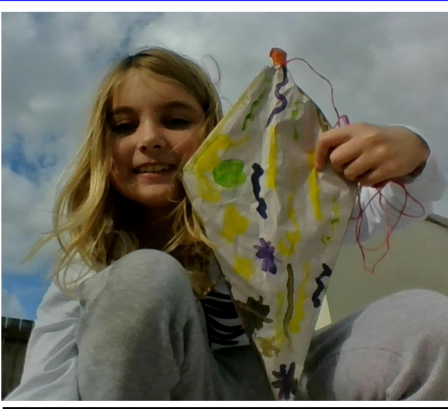
Fly a Kite Day