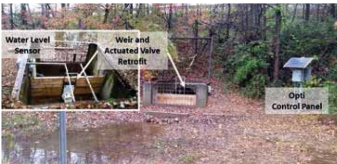
Figure 2: Above photo shows the dry pond retrofit outlet and control hardware components in Prince George's County, Maryland.