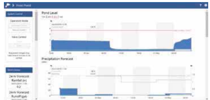
Figure 3: User interface and control dashboard used to view site data and manually control the valve at a dry pond retrofit in Prince George's County, Maryland

retrofit existing stormwater infrastructure.