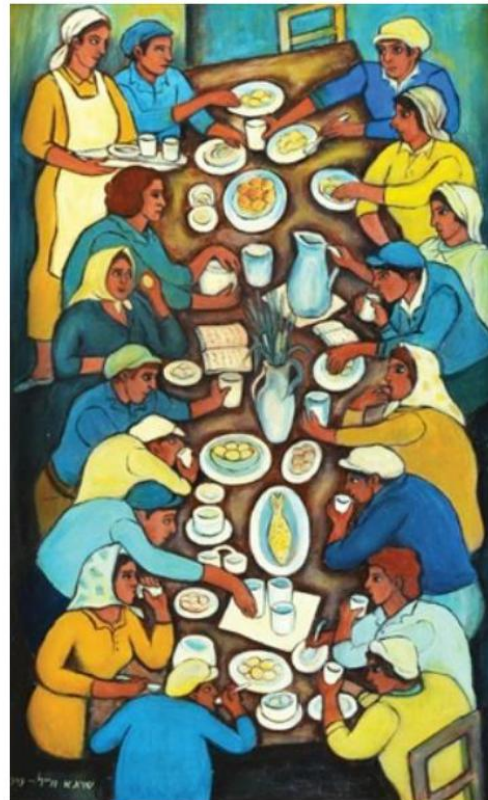
Shraga Weil, Passover Seder 1949

The only time of year that it's okay to have 4 glasses of wine with dinner.